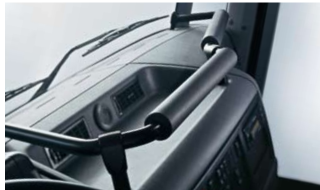
Grab handle: the optional, integrated grab handle on the upper face of the instrument panel enhances co-driver safety

Safety at work: the Econic's aluminium "space-cage" cab meets the requirements of the ECE R29/2 crash-test standard. As the pendulum impact test, roof strength test and rear-wall strength test show, the Econic offers optimum protection in every situation.