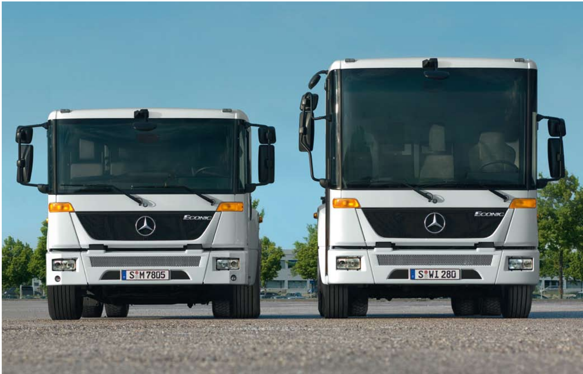
Cab variants: the low cab allows the use of higher bodies while the high cab offers more comfort