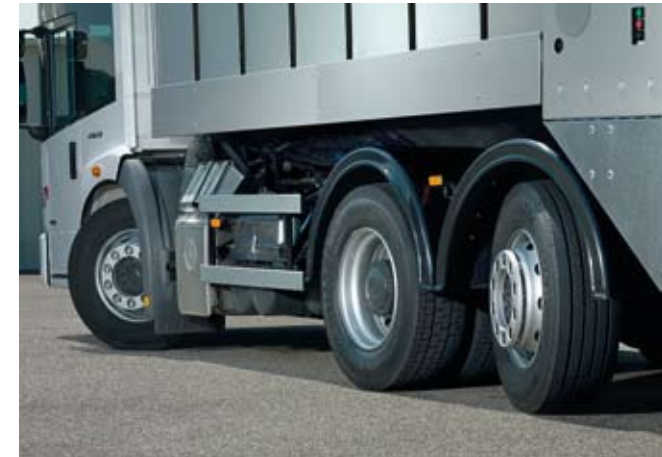
Forward-trailing or trailing axle: the optional electro-hydraulically steered forward-trailing or trailing axle makes the Econic extremely manoeuvrable