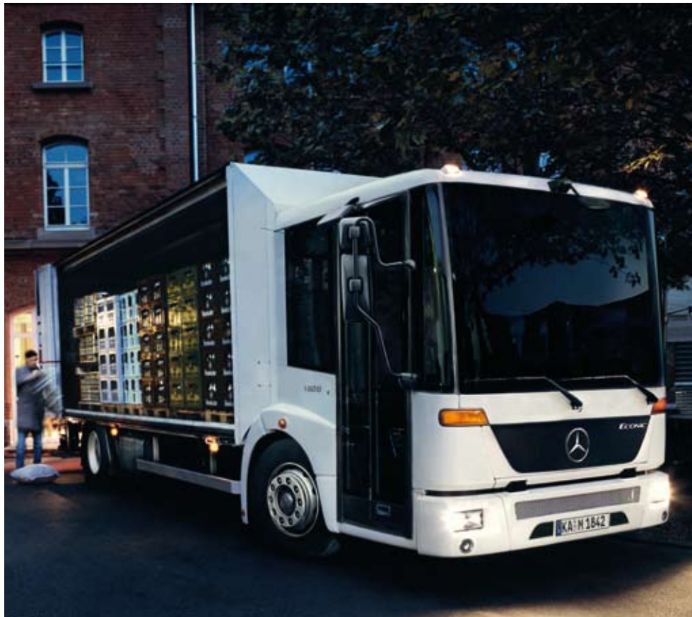
The gas-driven Econic distribution vehicles: lower costs, lower noise, lower emissions and freedom from city-centre operating restrictions