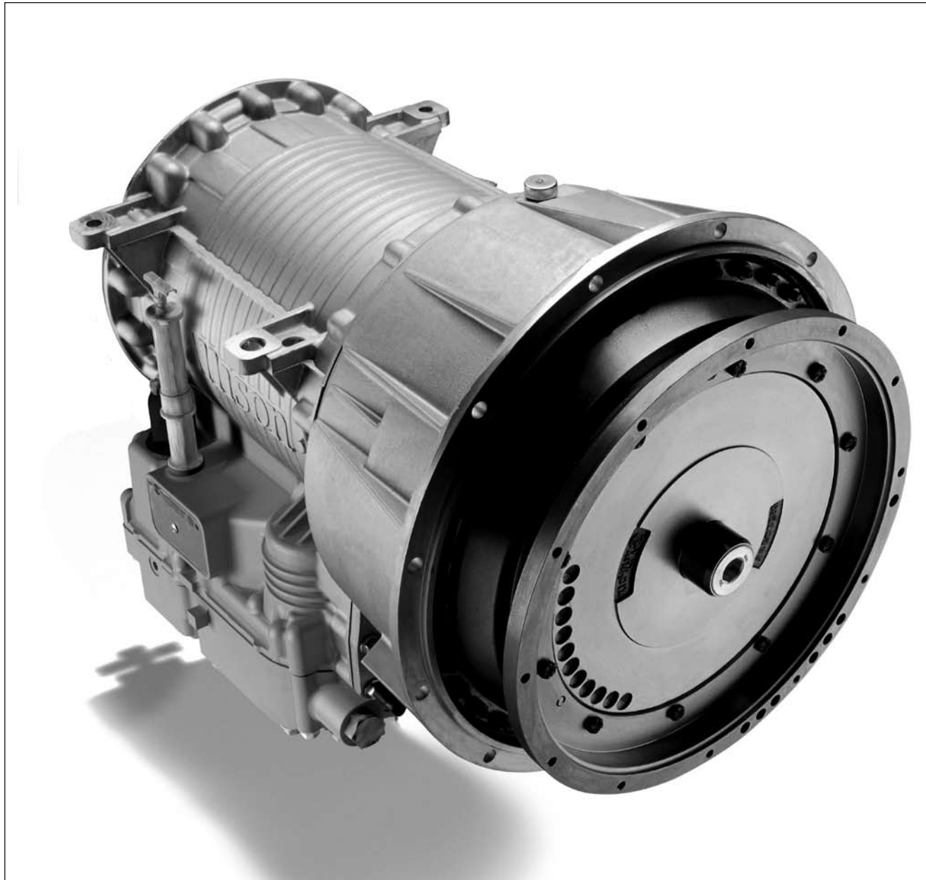
Allison automatic transmission: strong, reliable and requiring only low maintenance, the automatic transmission with push-button controls reduces fuel consumption further – this means greater ride comfort, especially when the vehicle is being operated in a stop-and-go application