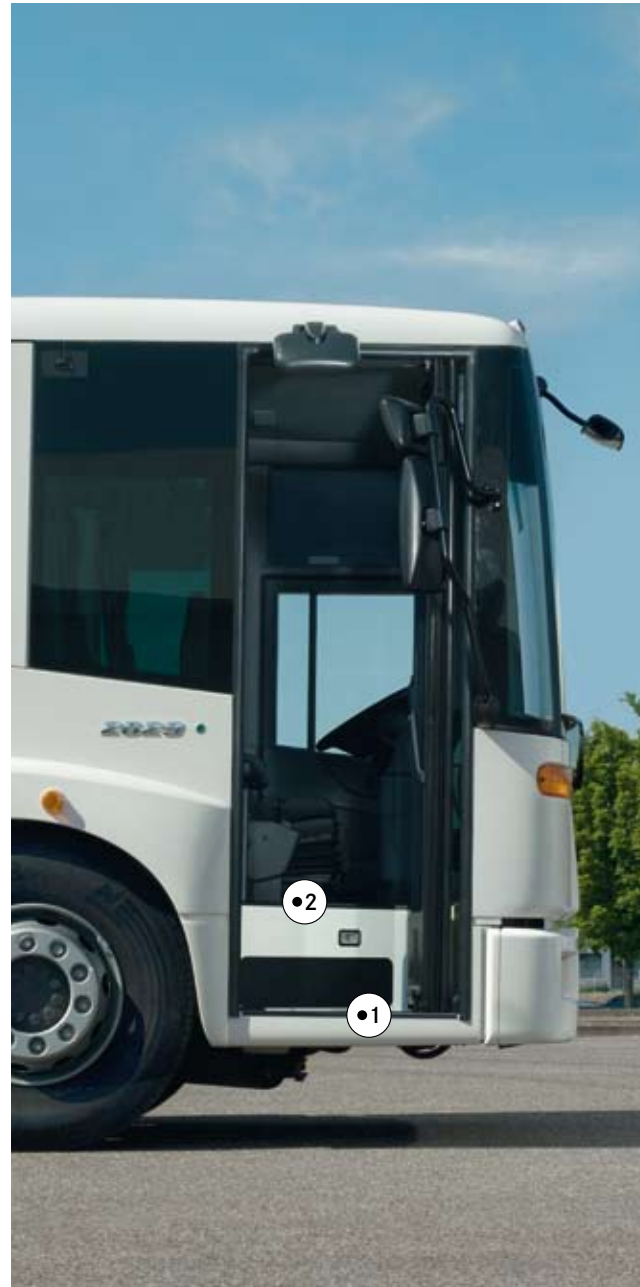
Econic low-entry design: boarding the Econic involves only one (1-2) step – protected by its integrated position in the cab, it has a rugged surface for optimum grip and fast boarding/alighting