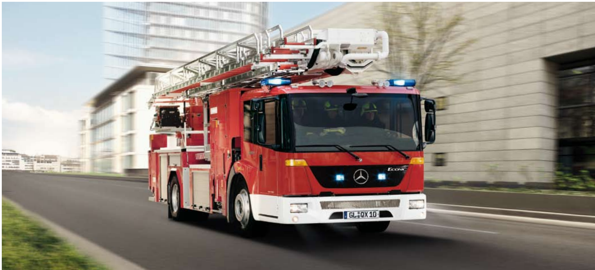
The Econic turntable ladder vehicle: with an overall height of just three metres, it can reach the scene of the emergency quickly and directly without having to avoid low underpasses