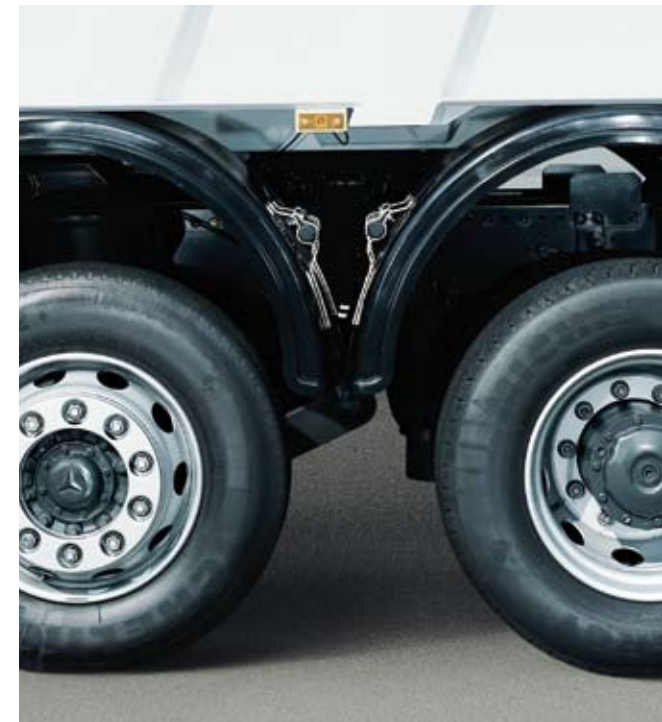
Raising/lowering function: depending on the variant and application, the raising/lowering function allows the Econic to be raised by up to 200 mm and lowered by as much as 60 mm