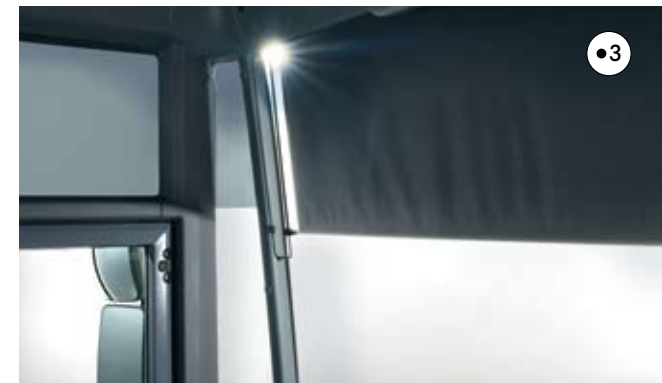
A better view: optimum visibility is ensured by the modified mirror array (1) with the upper wide-angle mirror on the driver's side and, below it, the main mirror, as well as by the optional reversing camera (2). The one-piece sunblind (3) offers effective dazzle protection even when the sun is low in the sky