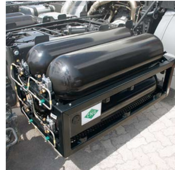
High-pressure tanks: protected by a solid steel frame, the gas bottles, along with the engine, lines, valves, etc. meet the high safety standards laid down in ECE R110