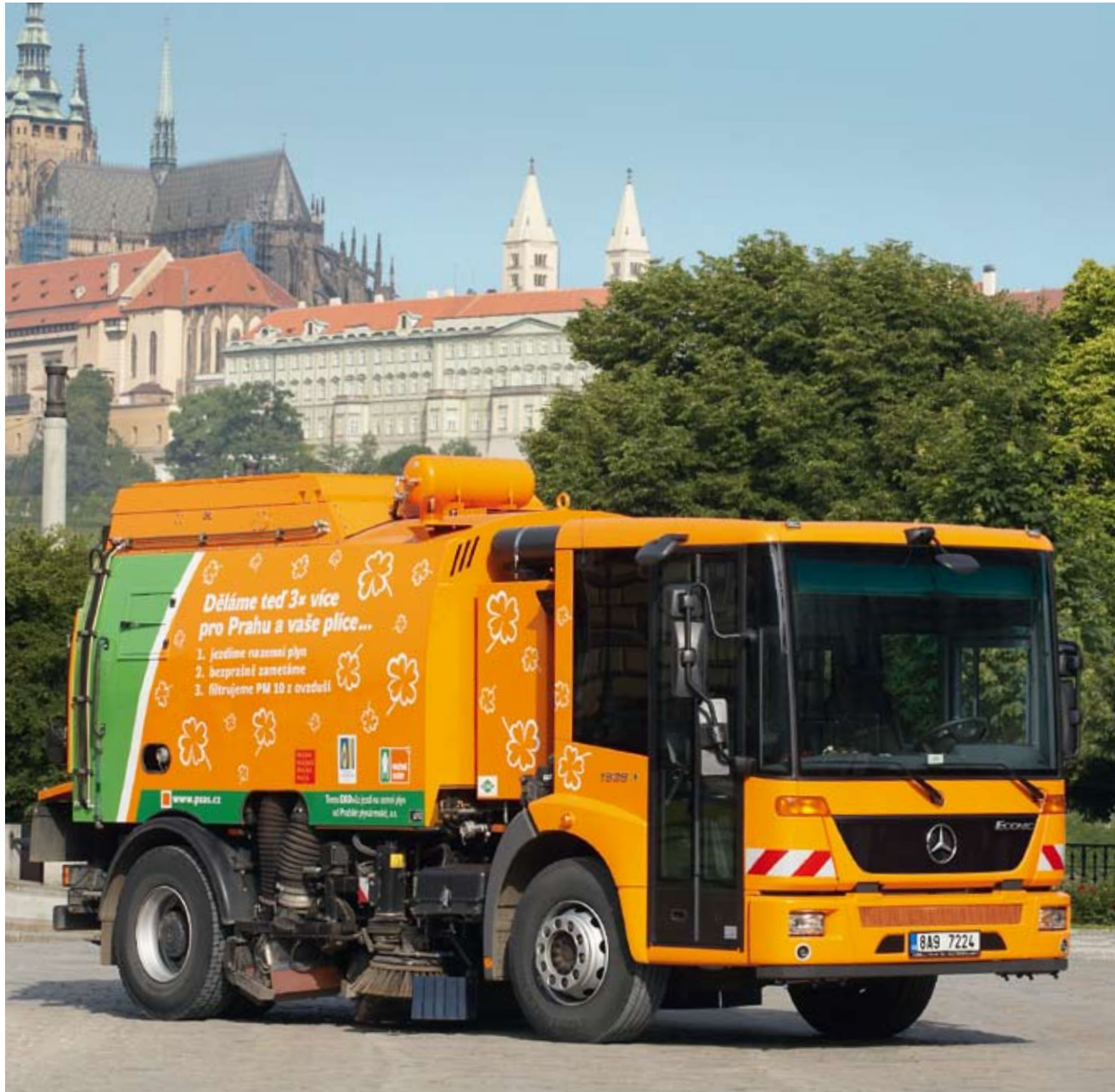
Gas-driven Econic sweeper in Prague: helping to keep the city and the environment clean