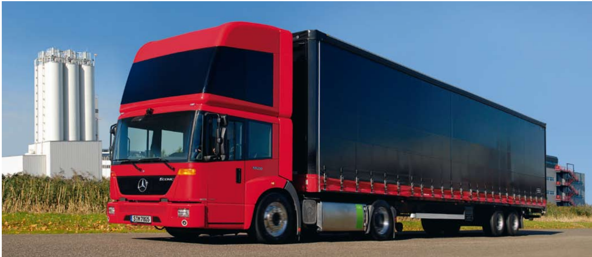
The Econic semi-trailer truck: environment-friendly and quiet, it is also able to accommodate shift work and overnight operations. Ideal for just-in-time transport