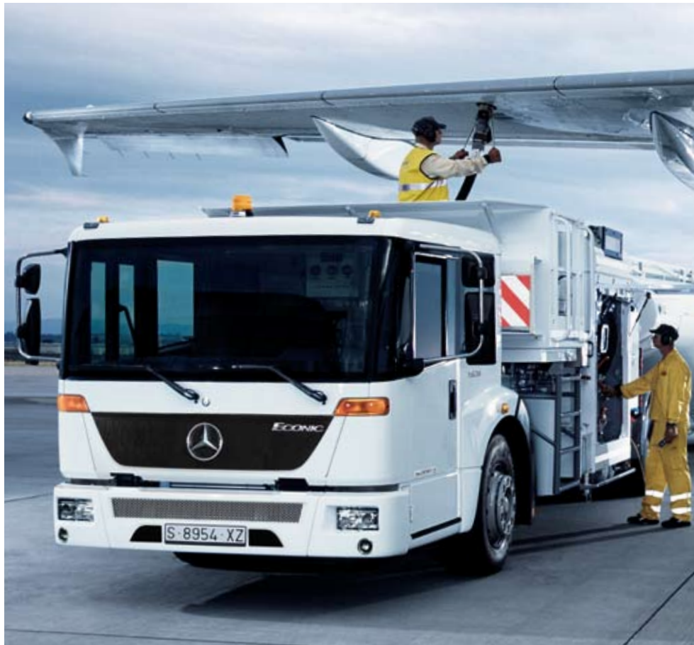
The Econic airfield fuel tanker: thanks to its low-floor frame with good body-mounting ability and low centre of gravity, the Econic makes an ideal airfield tanker