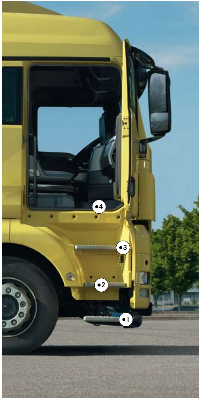
Conventional cab: entering a conventional cab involves a climb. Steps of differing heights (1-4) increase the time required to perform work processes