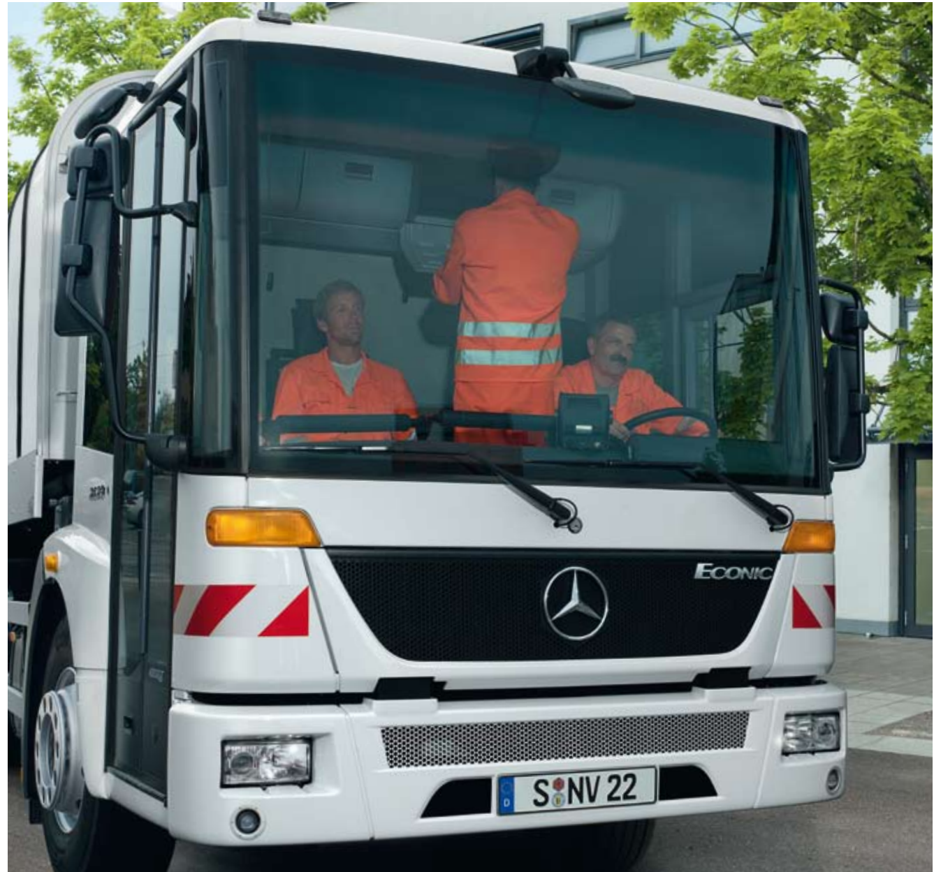
Height of convenience: the level floor throughout and the standing height of 193 cm in the standard cab provide optimum accommodation for up to four occupants