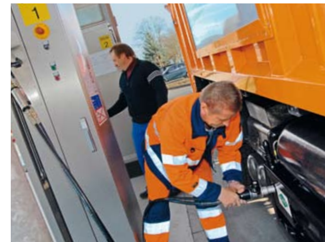
Filling up: refuelling the gas-driven Econic is fast, safe and clean