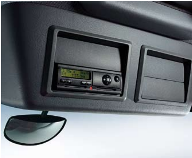
Pre-installation for communications equipment: four DIN slots in the area above the windscreen provide a secure, easily accessible installation space for the tachograph, Toll Collect unit or FleetBoard unit