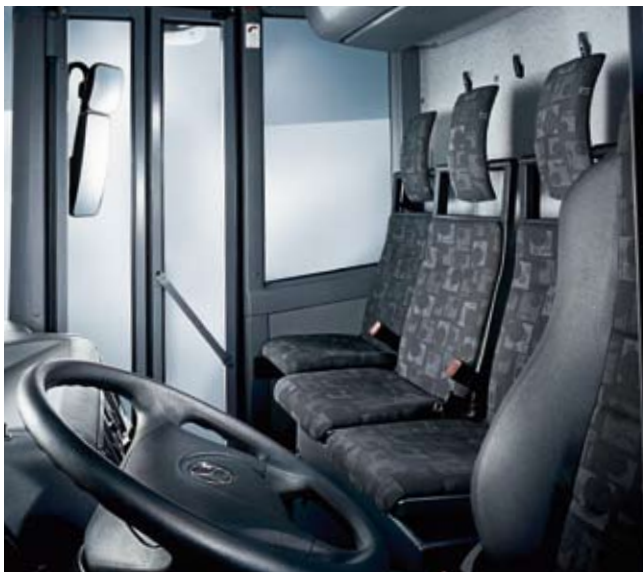
Height-adjustable steering wheel, driver's suspension seat and individual seats: the Econic offers an outstanding level of workplace comfort