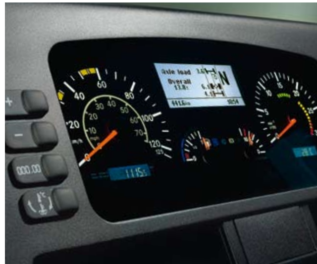
Instrument panel: the central axle-load measuring system provides a continuous display of the current load status and the gross weight of the individual axles

It goes without saying that particular emphasis is placed on safety: the cabs have a lightweight aluminium space-cage structure and meet the requirements of the ECE R29/2 crash-test standard.