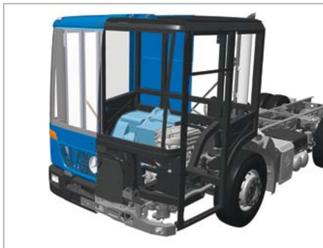
Aluminium space-cage cab: the Econic cabs have a lightweight aluminium space-cage structure and meet the requirements of the European ECE R29/2 crash-test standard

The Econic's large panoramic windows, the low top edge of the instrument panel and the fully-glazed folding door make for outstanding visibility and allow the vehicle to be manoeuvred extremely accurately. As a result, kerbing damage occurs noticeably less frequently. Visibility is enhanced even further by the modified mirror array, featuring a wide-angle mirror on the driver's side fitted above the main mirror which now has a wider field of view, as well as the optional reversing camera.